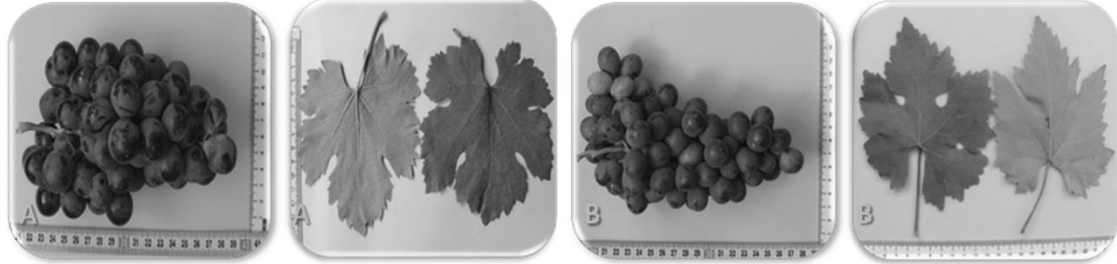
Figure 4. Bunch and mature leaf images of Öküzgözü (A) and Reşmiv (B) varieties

Şekil 3. Mercegöl (A) ve Mirani (B) çeşitlerinin salkım ve olgun yaprak resimleri