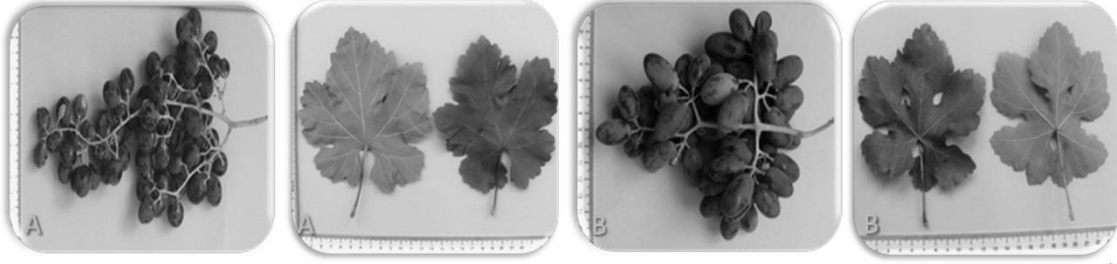
Figure 1. Bunch and mature leaf images of Besirane (A) and Daufi (B) varieties

Şekil 1. Besirane (A) ve Daufi (B) çeşitlerinin salkım ve olgun yaprak resimleri