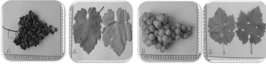
Figure 6. Bunch and mature leaf images of Tritelk (A) and Zerik (B) varieties

Şekil 6. Tritelk (A) ve Zerik (B) çeşitlerinin salkım ve olgun yaprak resimleri