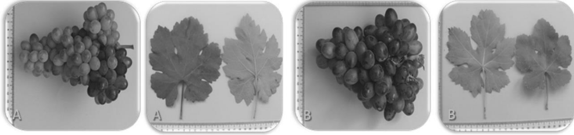
Figure 3. Bunch and mature leaf images of Mercegöl (A) and Mirani (B) varieties

Şekil 2. Ğatunok (A) ve Mercani (B) çeşitlerinin salkım ve olgun yaprak resimleri